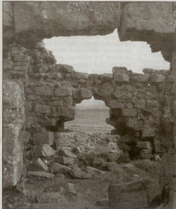
A view of Scotland through ruins on the south end of Rathlin Island.

(about four miles roundtrip), so we could get back in time to catch the ferry back to Ballycastle. As we headed out of Rathlin's only village, up the small road, we realized the golden retriever, (we had already named her "Bally") was going to serve as our tour guide for the day.